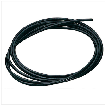
RT6/4 Nylon tubing \varnothing 6/4 or \varnothing 8/6