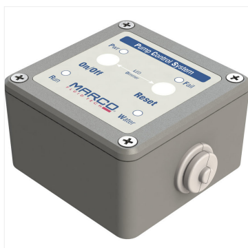
PCS 12/24V Control panel for electronic pumps