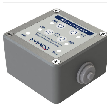
SCS 12/24V Speed control system for electronic pumps