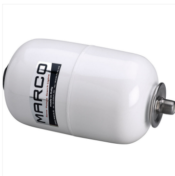
AT2 Accumulator tank, 5 l , white