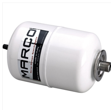
AT1 Accumulator tank, 2 l , white