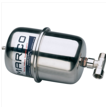
ATX2 Stainless steel accumulator tank 2 l with 1/2" T-nipple