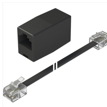
RJ11 Black cable with coupler for SCS / PCS