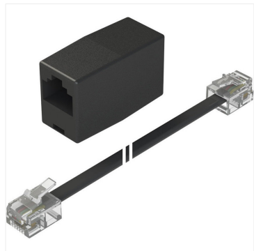
RJ11 Black cable with coupler for SCS / PCS