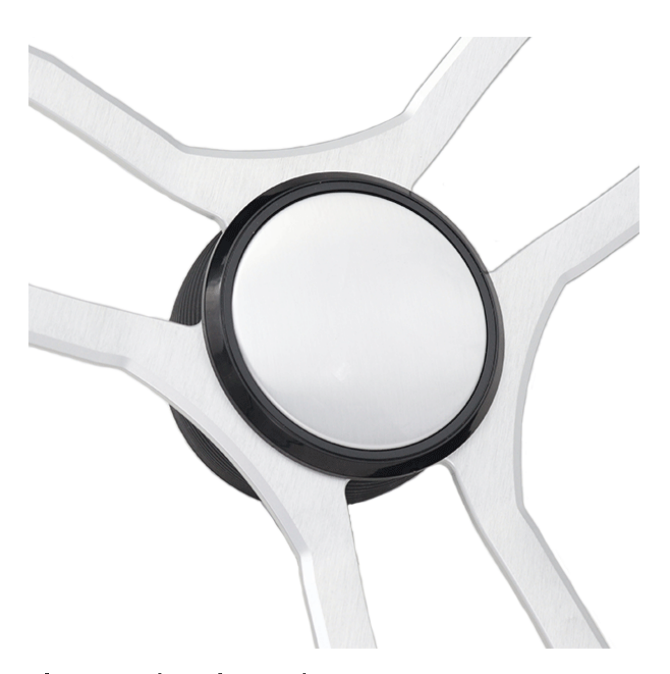
Elegant Tri-spoke Design