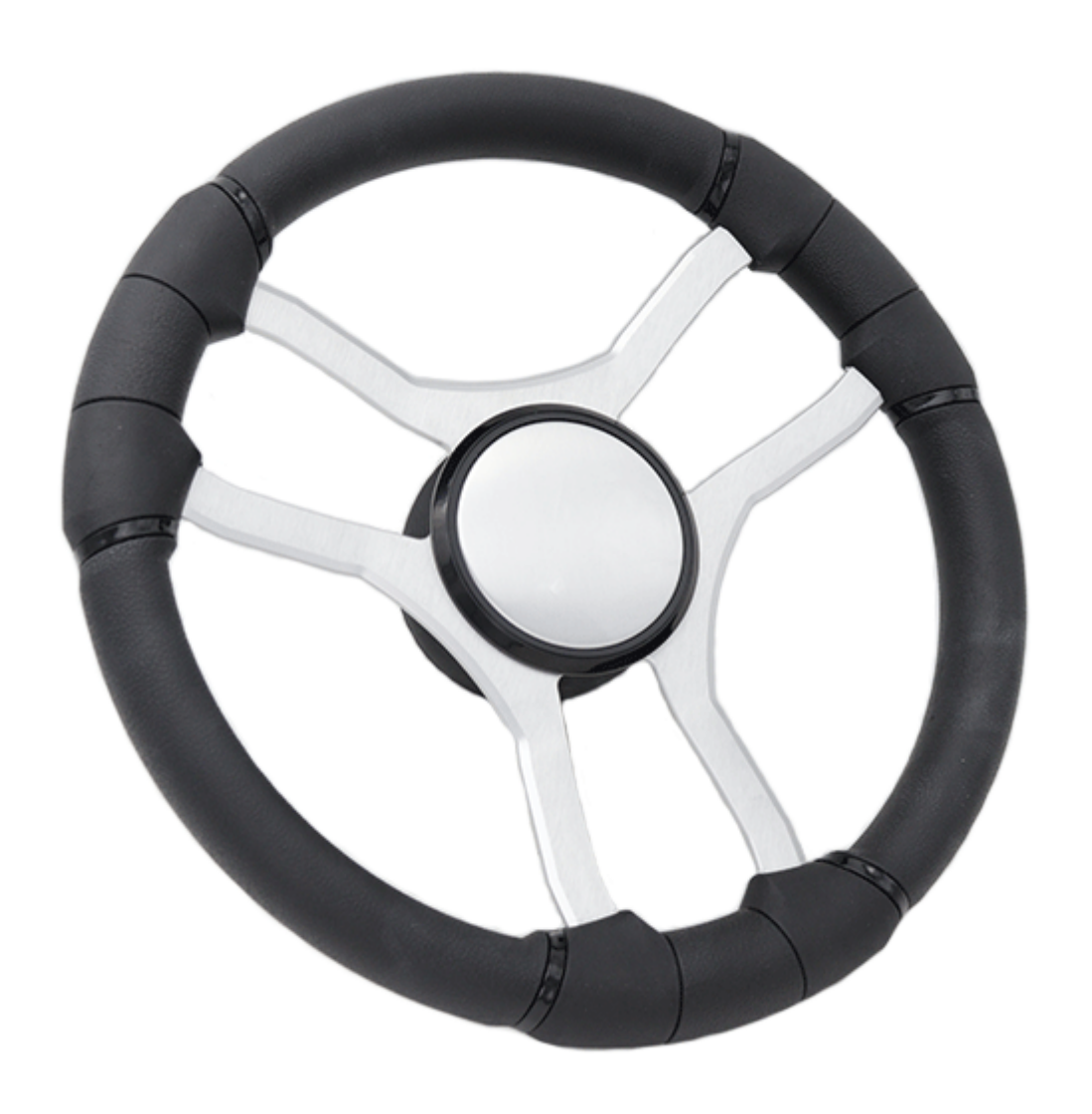
Black Polyurethane Grip