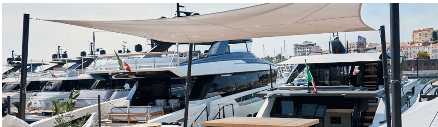
IC-IP4500SS Fixing From Above