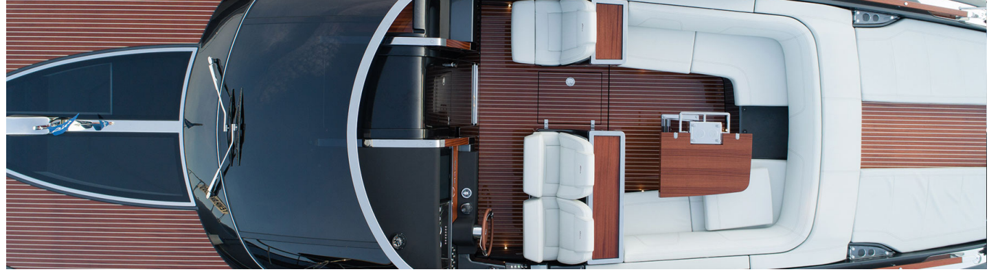
Riva with Mini NRG single wiper arm in polished finish

Control Panel Traditional mechanical switching or touch screen.