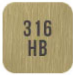
316 HB 316 PVD BRUSHED HIGH BRASS

Aside from the standard brushed stainless steel finish, we are able to also offer the following PVD finishes to our 316-grade tapware. These finishes are produced to order so please contact us for more information.