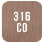
316 CO 316 PVD BRUSHED COPPER