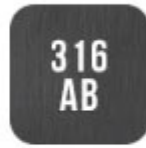
316 AB 316 PVD BRUSHED ABSOLUTE BLACK