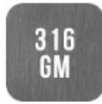
316 GM 316 PVD BRUSHED GUN METAL