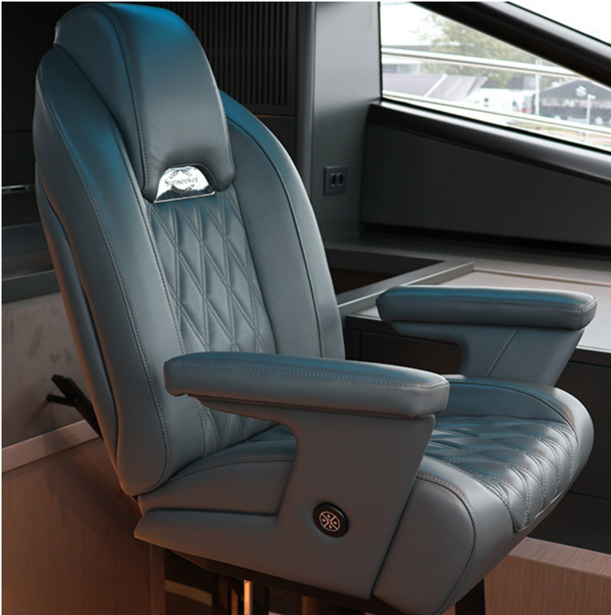
Custom logo embroidery