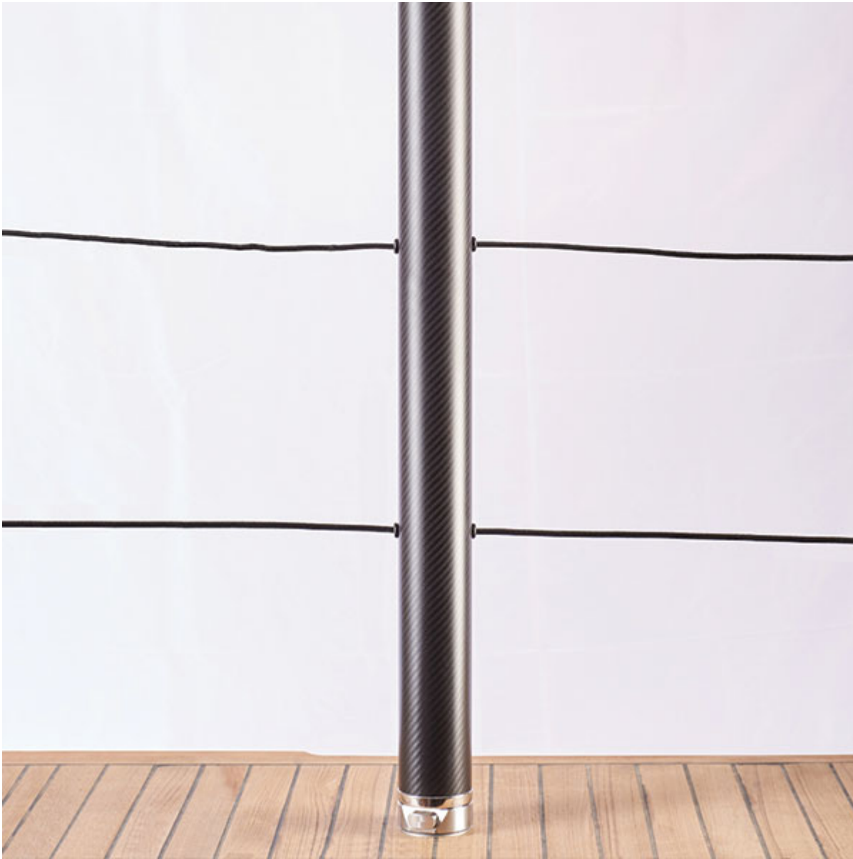
A Ø45mm stanchion pole is available for the Q32 base. This is a 1000mm tall pole