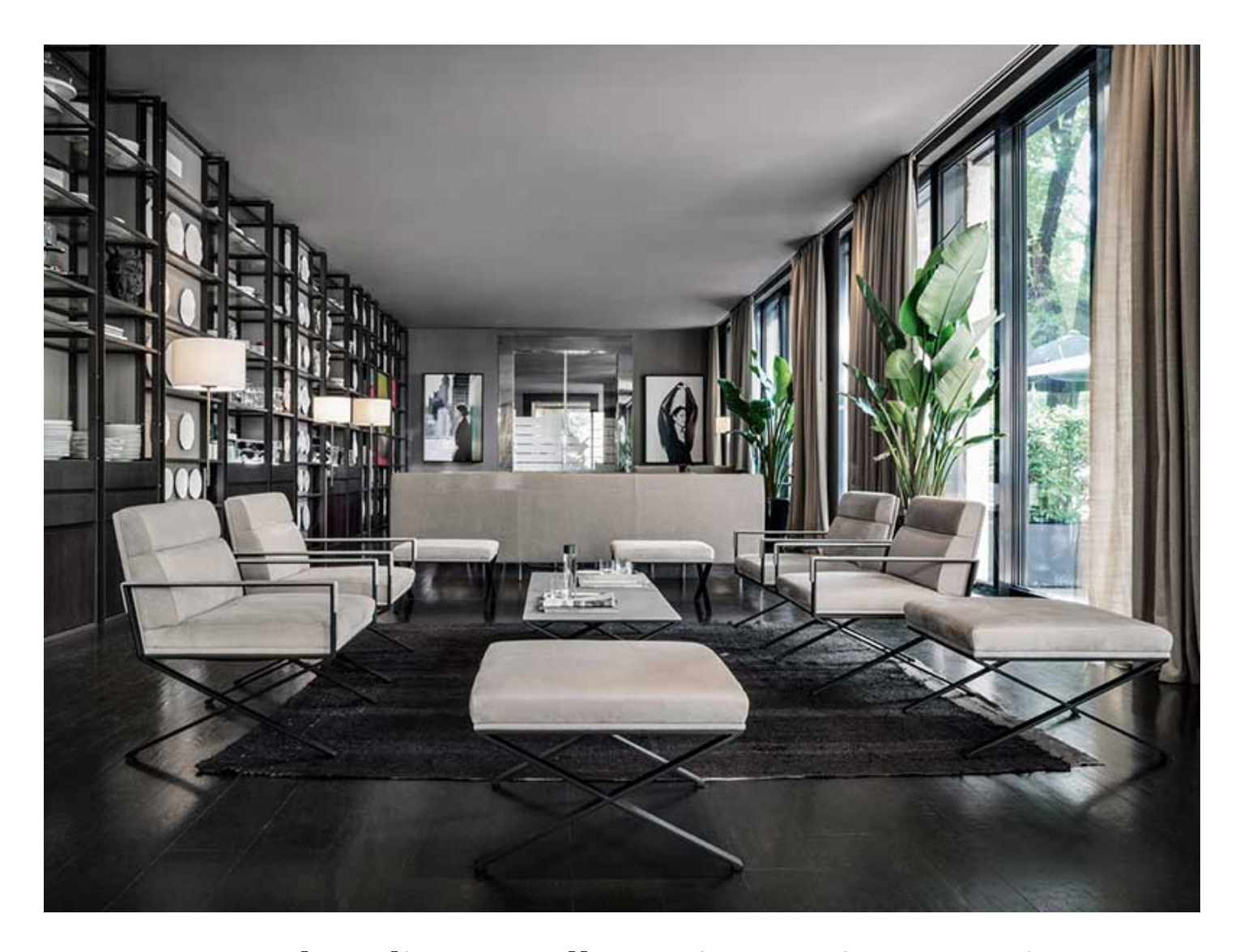
Frag Srl: Italian Excellence in Furniture Design

Frag Srl, renowned for its Italian craftsmanship, brings over 90 years of experience to the world of luxury furniture. Specialising in leather and high-quality materials, Frag combines traditional techniques with modern aesthetics to create timeless pieces that epitomise elegance and sophistication. Their dedication to innovation and design has established them as a leader in the furniture industry.