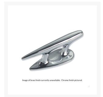
Image of brass finish currently unavailable. Chrome finish pictured.