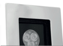
PROMETEO QP art./ref. 5182

Standard 31° photometric information displayed below. Photometric data on other lens angles available on request.