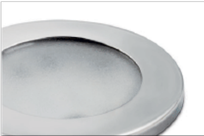
THABIT S art./ref. 5200