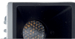
ALFA CRIS I art./ref. 5230

Photometric data shown below for single LED fitting (Alfa-Cris I). Please note that Alfa-Cris II is a double LED fitting. Standard 31° lens angle information displayed below, for alternative lens angle data please contact our technical department.