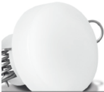
CHARA T art./ref. 6070