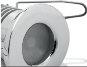
NAOS T art./ref. 6146