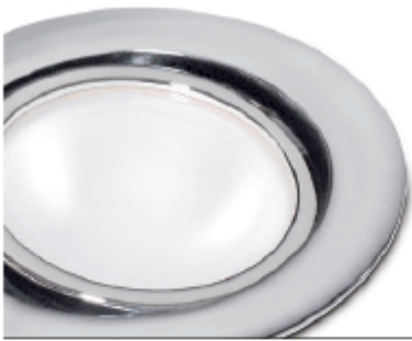
PHOENIX A art./ref. 8540