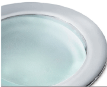
PHOENIX AV art./ref. 8541