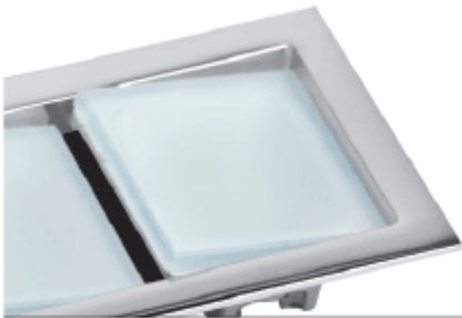
KEPLERO II art./ref. 8561

Below photometric data is for a single spotlight unit: