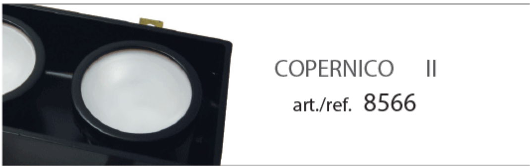
COPERNICO II art./ref. 8566

Below photometric data is for a single spotlight unit: