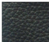
Image not currently available for all finishes. Please refer to swatch for actual leather colour.