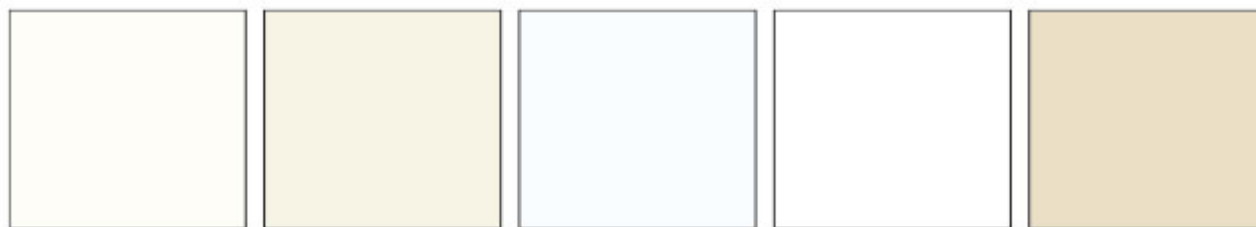
RAL 9010 RAL 9001 RAL 9016 RAL 9003 RAL 9013