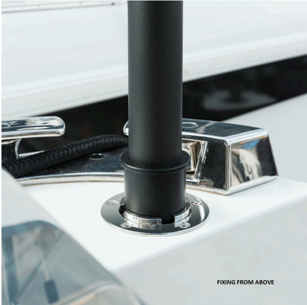
FIXING FROM ABOVE