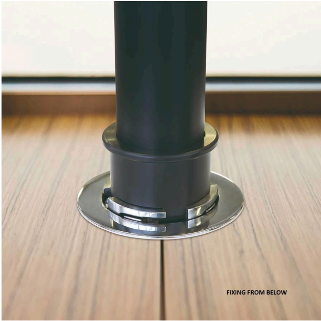
FIXING FROM BELOW