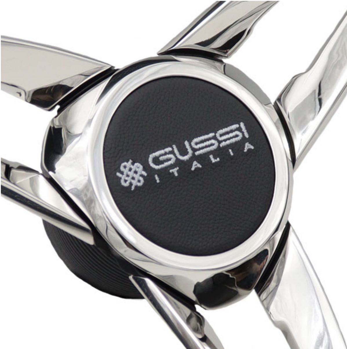
Stainless Steel Double Spoke Design