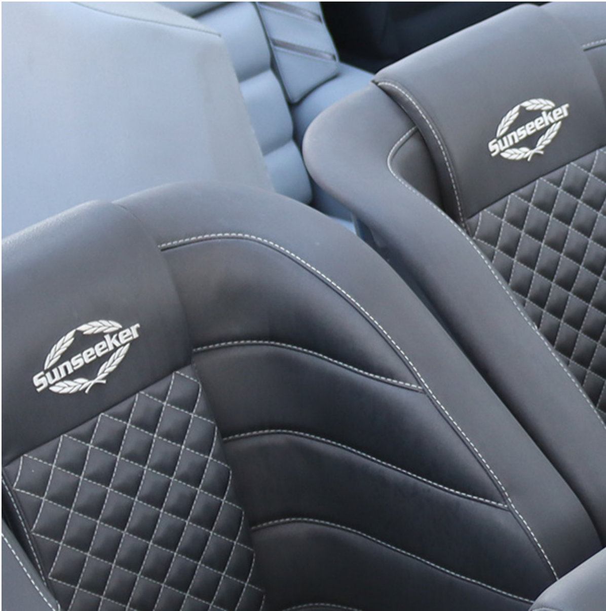
Stitching in a contrast colour