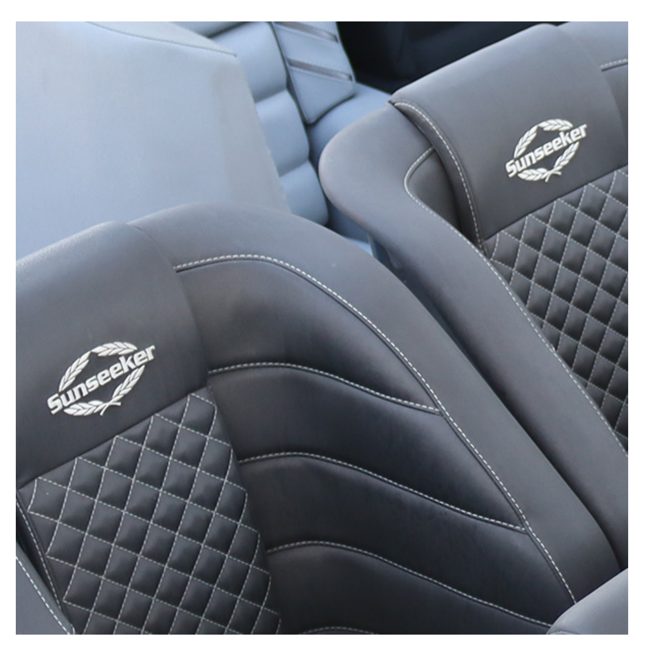
Stitching in a contrast colour