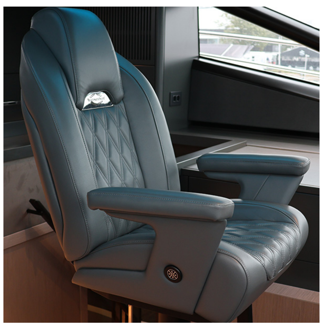
Custom logo embroidery