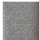
2030 Ice Blue