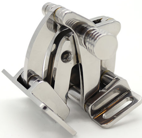
Compact version with pin pictured