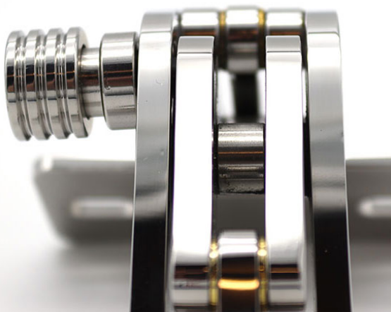
Compact version with pin pictured