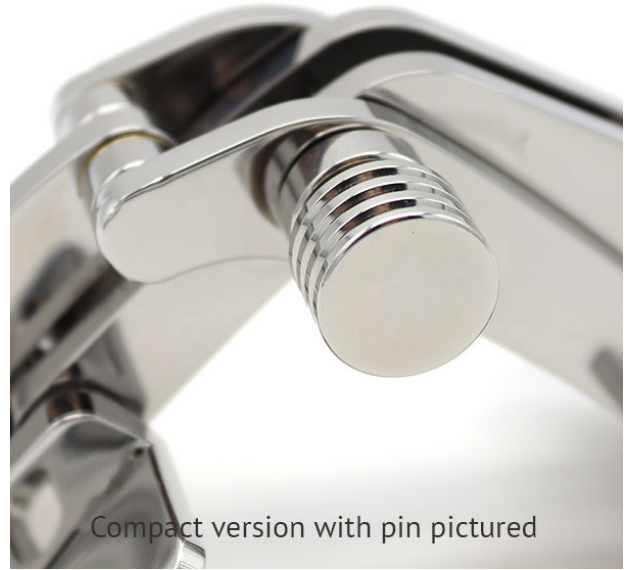
Compact version with pin pictured